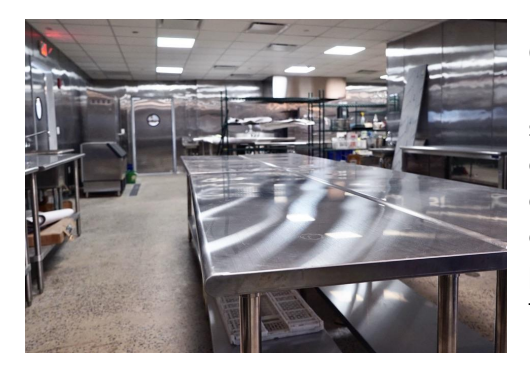
COMMERCIAL KITCHEN 1,600 ft<sup>2</sup> catering kitchen with state-of-the-art cooking equipment and onsite composting. Chef partners are encouraged to incorporate produce that we're growing on the farm into their menus.

House-made seasonal cocktails and sustainably sourced beverages will be served from our 15 ft reclaimed maple wood and subway tile bar. Features include locally designed light pendants and custom-crafted display shelving.